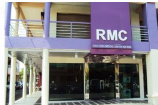
Rafflesia Medical Centre (RMC) www.rafflesiamedicalcentre.com +6088-240 640