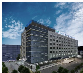
Jesselton Medical Centre http://jmc.my +6088-366 333