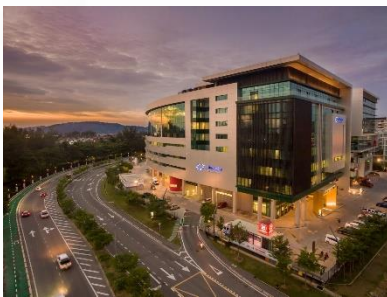
Gleneagles Kota Kinabalu http://gleneagleskk.com.my +6088-518 888

Government hospitals, clinics and dispensaries are available in all towns. The list of private medical practitioners and pharmacies are available in the local phone directory. However, those with specific medical needs are advised to have a good supply of medications. Some of the medical institutions around Kota Kinabalu are: