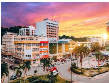
Permai Polyclinics KK (24 Hours) www.kpjsabah.com +6088-232100 / +6019-8232 100