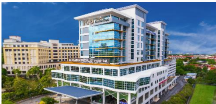
KPJ Sabah Specialist Hospital www.kpjsabah.com +6088-322 000