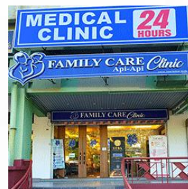
Family Care Clinic Api-Api www.familycareclinicmy.com +6012-851 4847